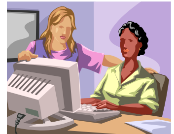
The Graduate Studies Office—working hard to meet the needs of the College of Education graduate students.

The faculty and staff members have a combined total of almost 50 years of experience in the USF College of Education.